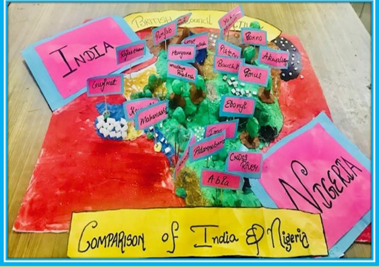
The budding artists locating the areas having different natural resources in the countries understudy